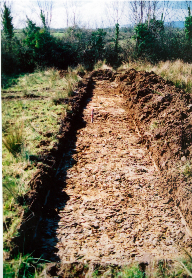
Photo 7: Trench 6 after excavation showing surface of subsoil (Context 602).