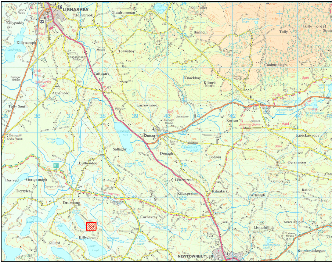
Figure 1: Location of site