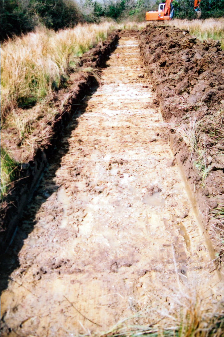
Photo 8: Trench 7 after excavation showing surface of subsoil (Context 702).