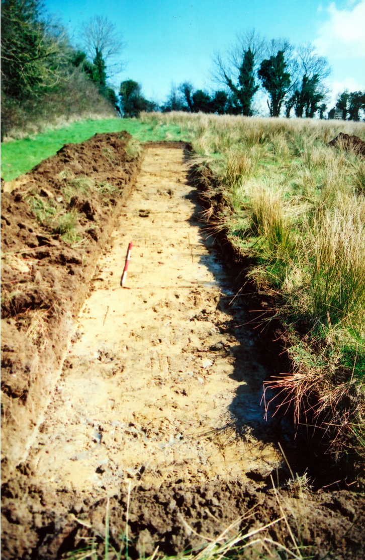
Photo 2: Trench 1 after excavation showing surface of subsoil (Context 102).