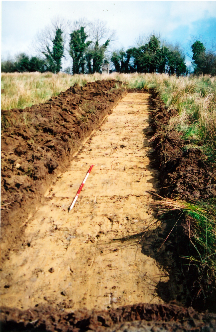
Photo 5: Trench 4 after excavation showing surface of subsoil (Context 402).