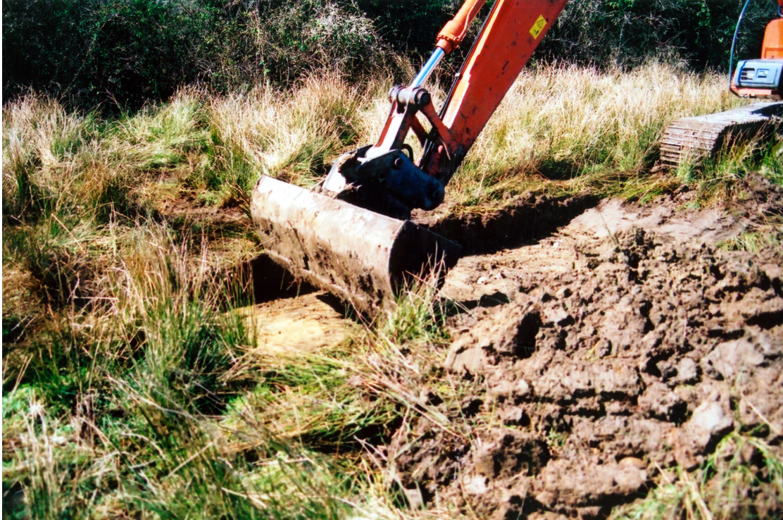
Photo 1: Excavation of Tr. 1 showing utilization of toothless “sheugh” bucket.