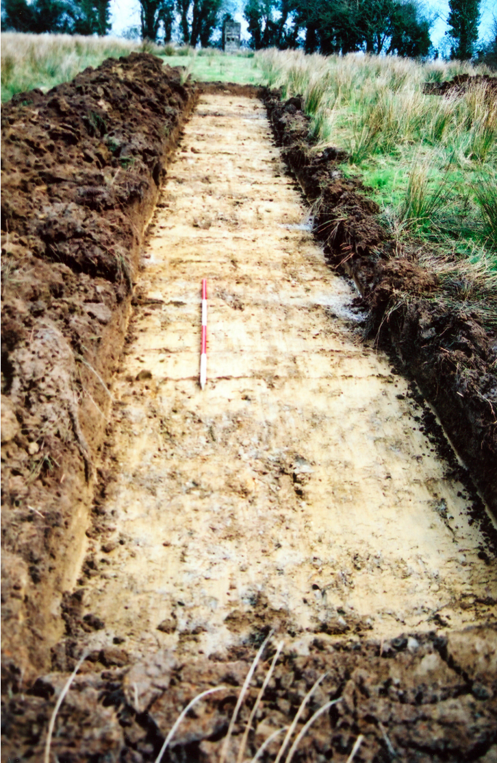
Photo 6: Trench 5 after excavation showing surface of subsoil (Context 502).