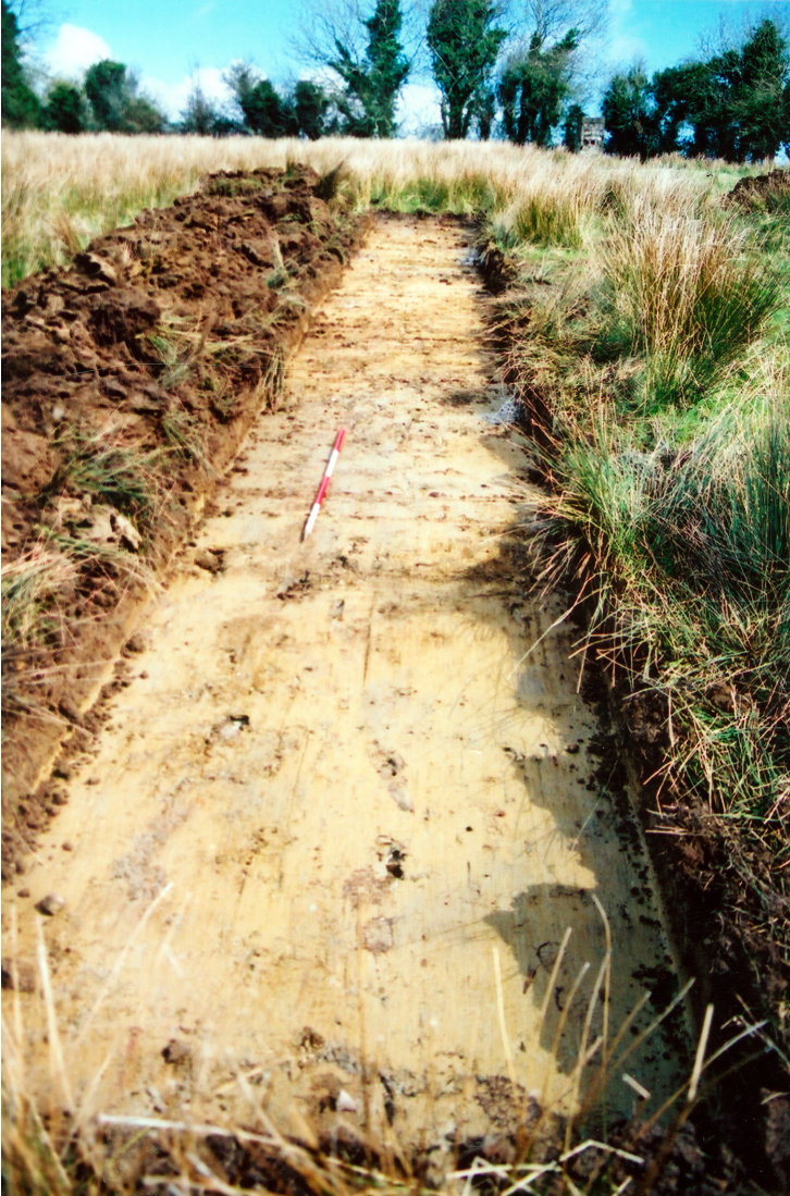
Photo 4: Trench 3 after excavation showing surface of subsoil (Context 302).