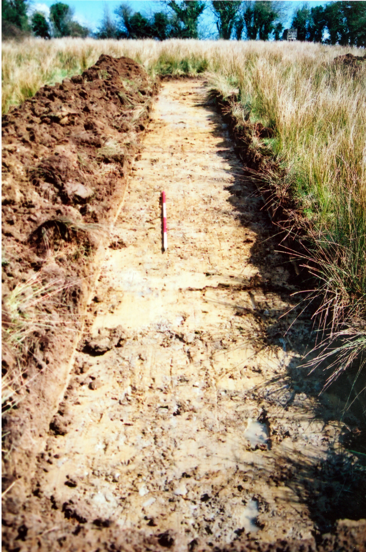
Photo 3: Trench 2 after excavation showing surface of subsoil (Context 202).