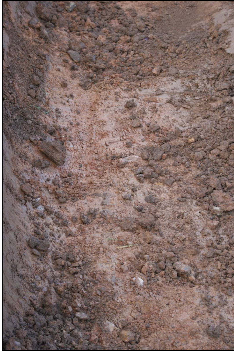
Plate 1 Natural subsoil (Context Numbers 103, 204 and 303).