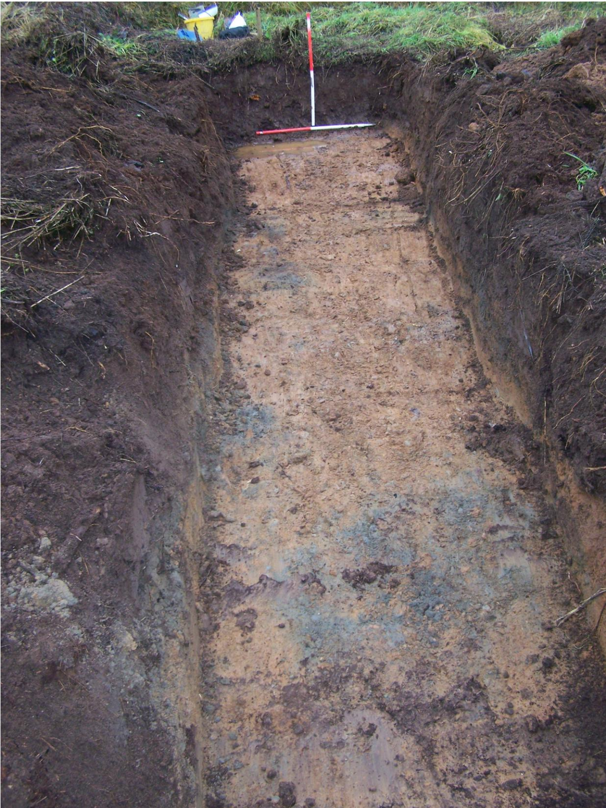
Plate 2. Trench 1. From the south-east.