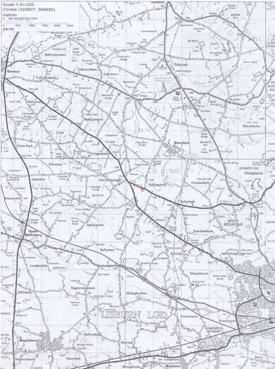
Fig 1. Location map of proposed archaeological evaluation at a site between 33 and 37 Sheepwalk Road, Ballynadolly, Lisburn, County Antrim. Site marked in orange.