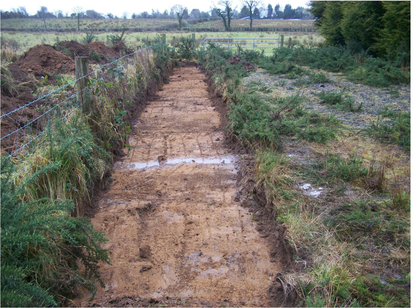
Plate 3. Trench 2. From north-east. The tree-line on the right of the photograph is the western boundary of the proposed development site. The iron gate is the southern boundary, close to the south-west corner. The wire and post fence on the left of the photograph is a temporary structure, not marked on any of the maps supplied. This temporary fence separates the eastern portion of the site where the proposed dwelling is to be located and the western portion which is currently used as a laneway from Sheepwalk Road through the proposed development site and giving access to the field beyond it.