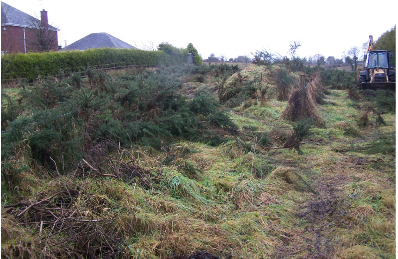
Plate 1. The proposed development site between 33 and 37 Sheepwalk Road, Ballynadolly, Lisburn, County Antrim. Photograph taken from the north. The house on the left of the shot is No. 33 Sheepwalk Road. The adjacent hedge and wooden fence is the eastern boundary of the proposed development site.