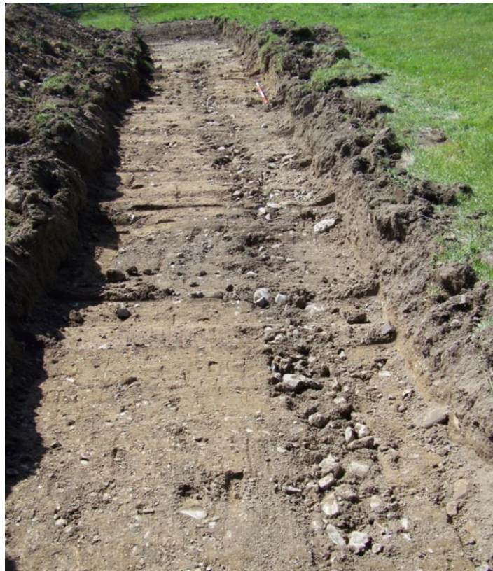
Plate 9: General view of Trench 3 looking southwest