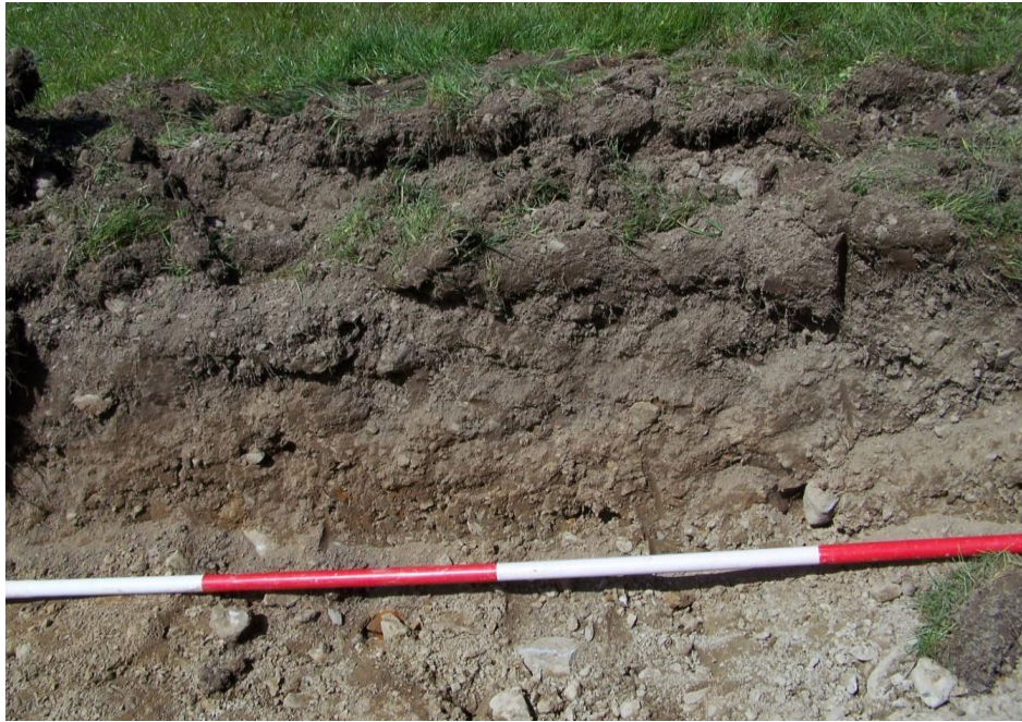
Plate 8: Southeast facing section of Trench 3