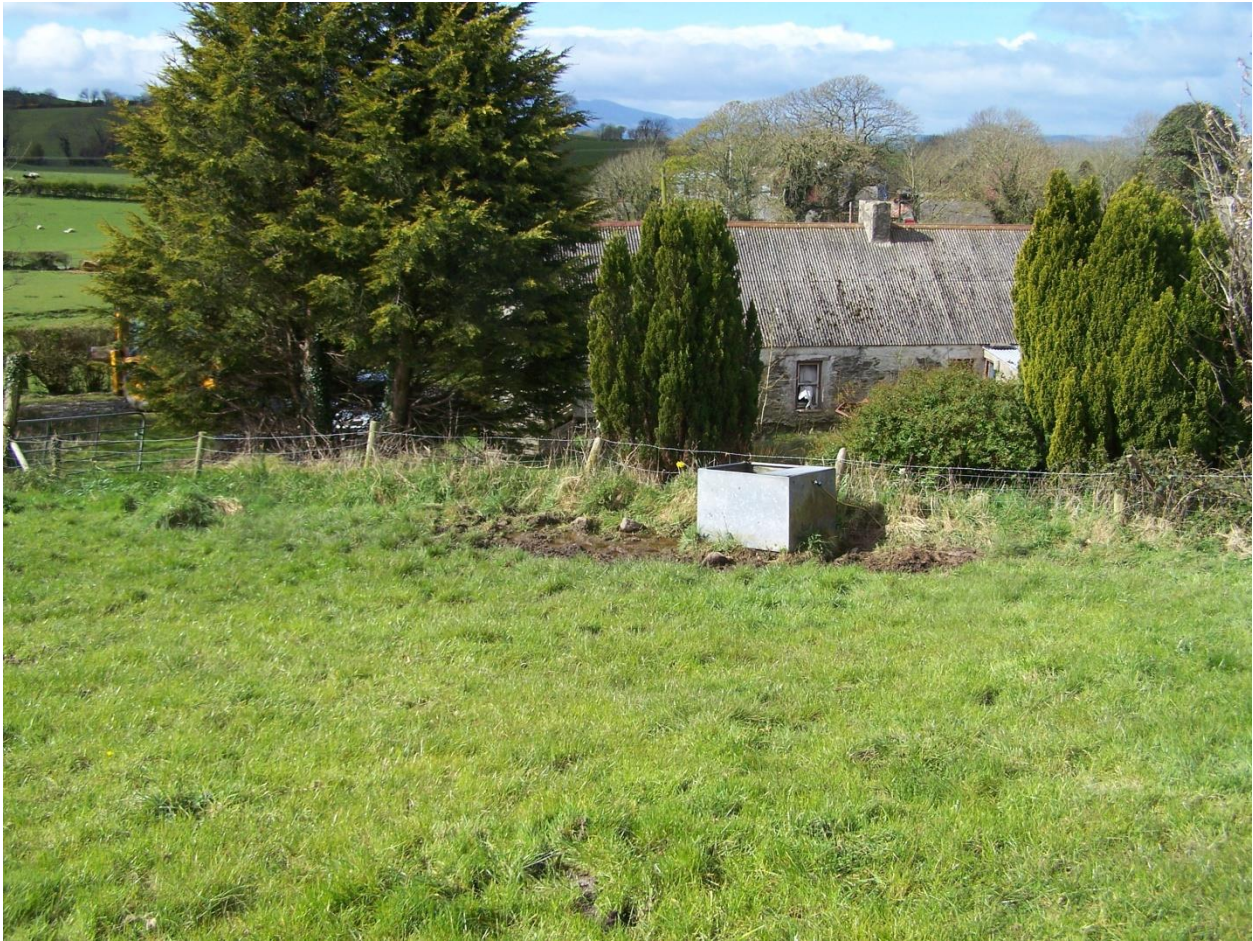
Plate 1: General view of the site prior to excavation, looking southwest and showing the obstructing wire fence, trees, shrubs and house which currently stand on the application site.