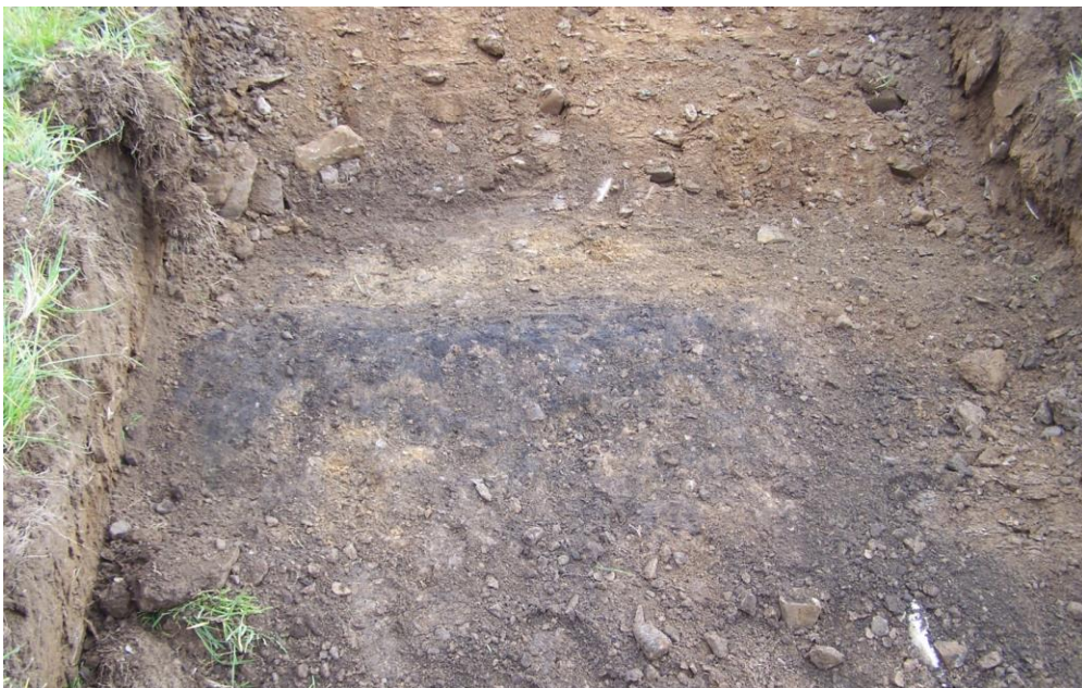
Plate 5: General view of thin spread of burnt layer (C204) with natural subsoil showing beneath