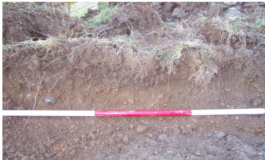
Plate 12: Northeast facing section of Trench 4