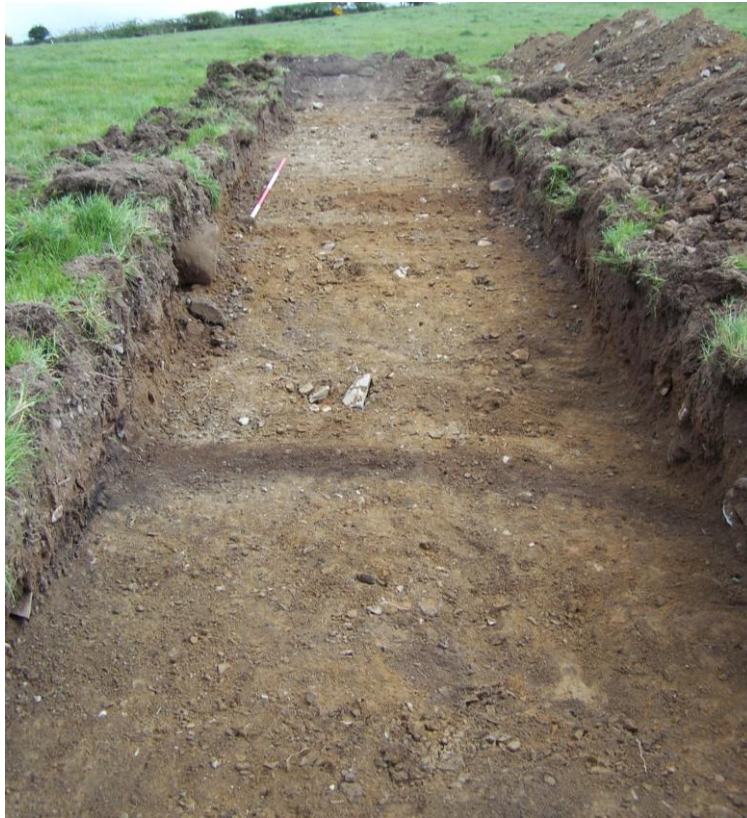
Plate 6: General view of Trench 2 looking Northeast, the curvilinear feature (C205/206) clearly shown in the foreground