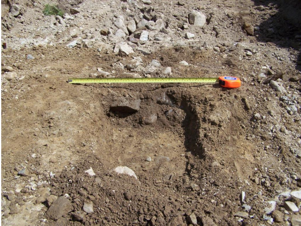
Plate 10: Trench 3 post excavation of a section through the field drain (C304)