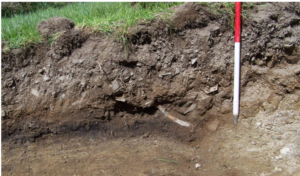
Plate 7: Southeast facing section of Trench 2, post removal of C206 to subsoil, showing the depth of the cut for the curvilinear feature (C205) and its association with burnt layer C204