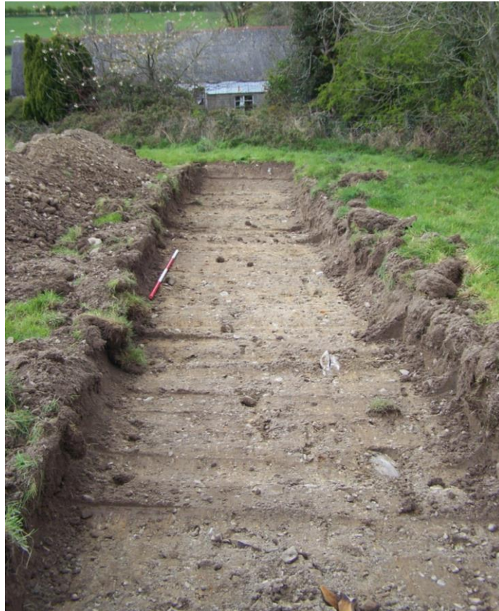
Plate 2: General view of Trench 1 looking southwest