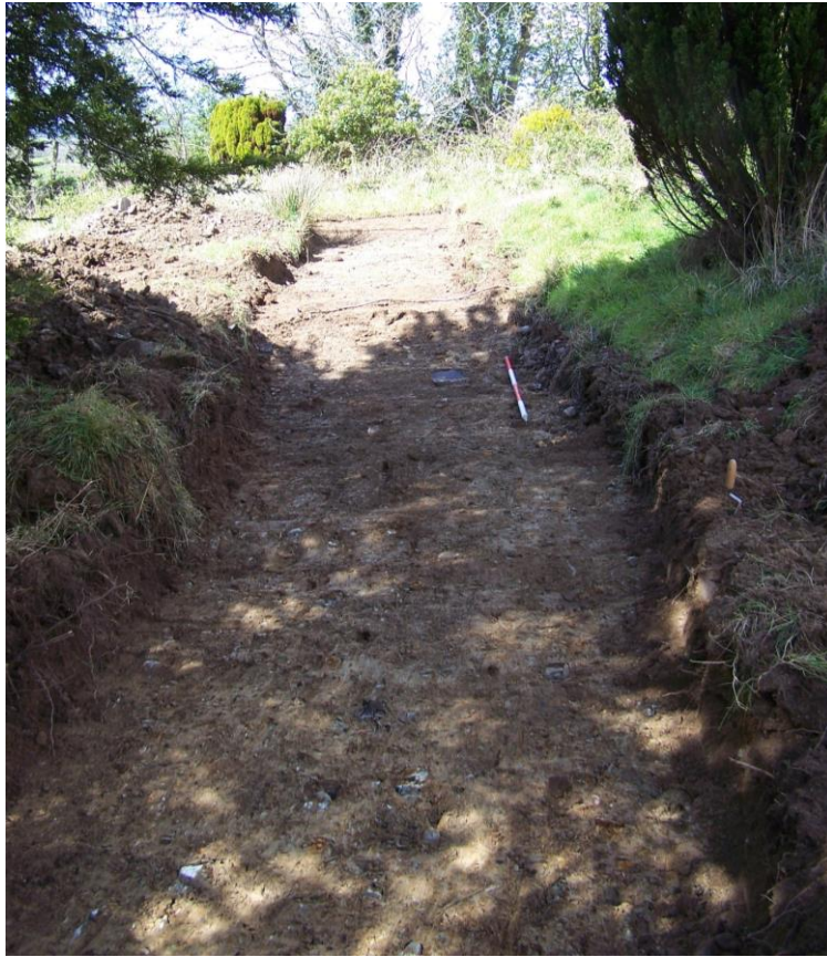
Plate 11: General view of Trench 4 looking northwest