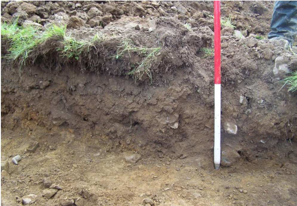
Plate 4: Northwest facing section of Trench 2 showing maximum thickness of mottled orange layer C203