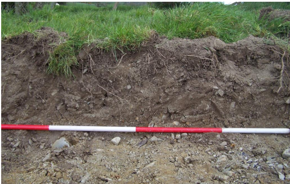
Plate 3: Southeast facing section of Trench 1