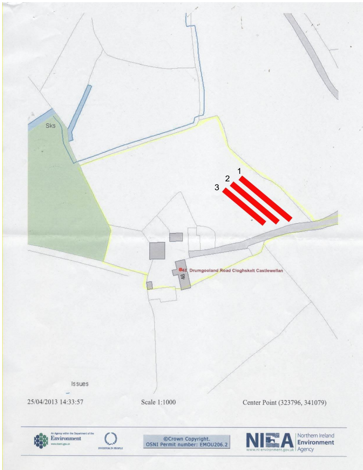
Figure 3: Site plan showing approximate location of test trenches