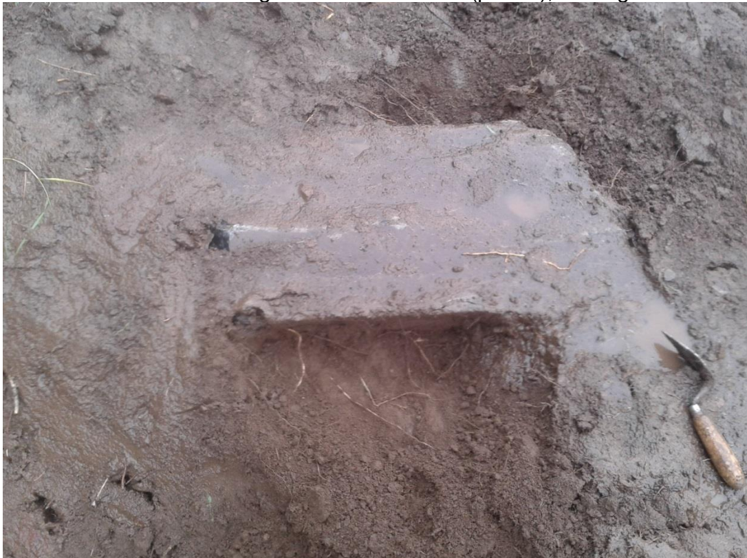
Plate 6: Angular stone in Trench 1, looking south