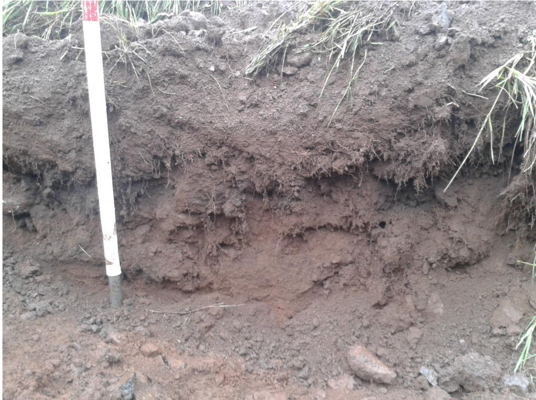
Plate 5: West-facing section of Trench 1 (part of), looking east