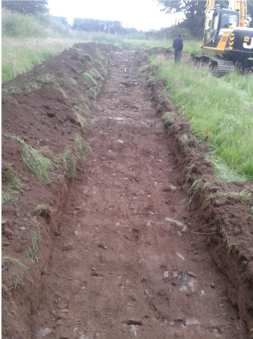
Plate 4: Trench 1 following excavation to subsoil level, looking south