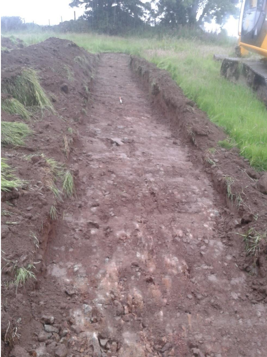
Plate 9: Trench 3 following excavation to subsoil level, looking south