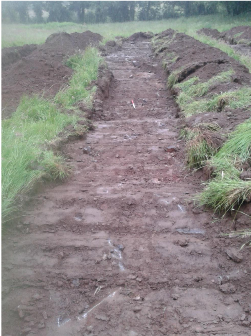
Plate 7: Trench 2 following excavation to subsoil level, looking north