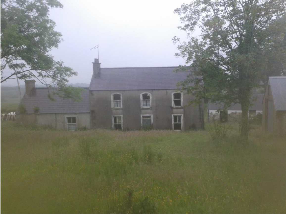
Plate 3: The dwelling due to be replaced, looking west