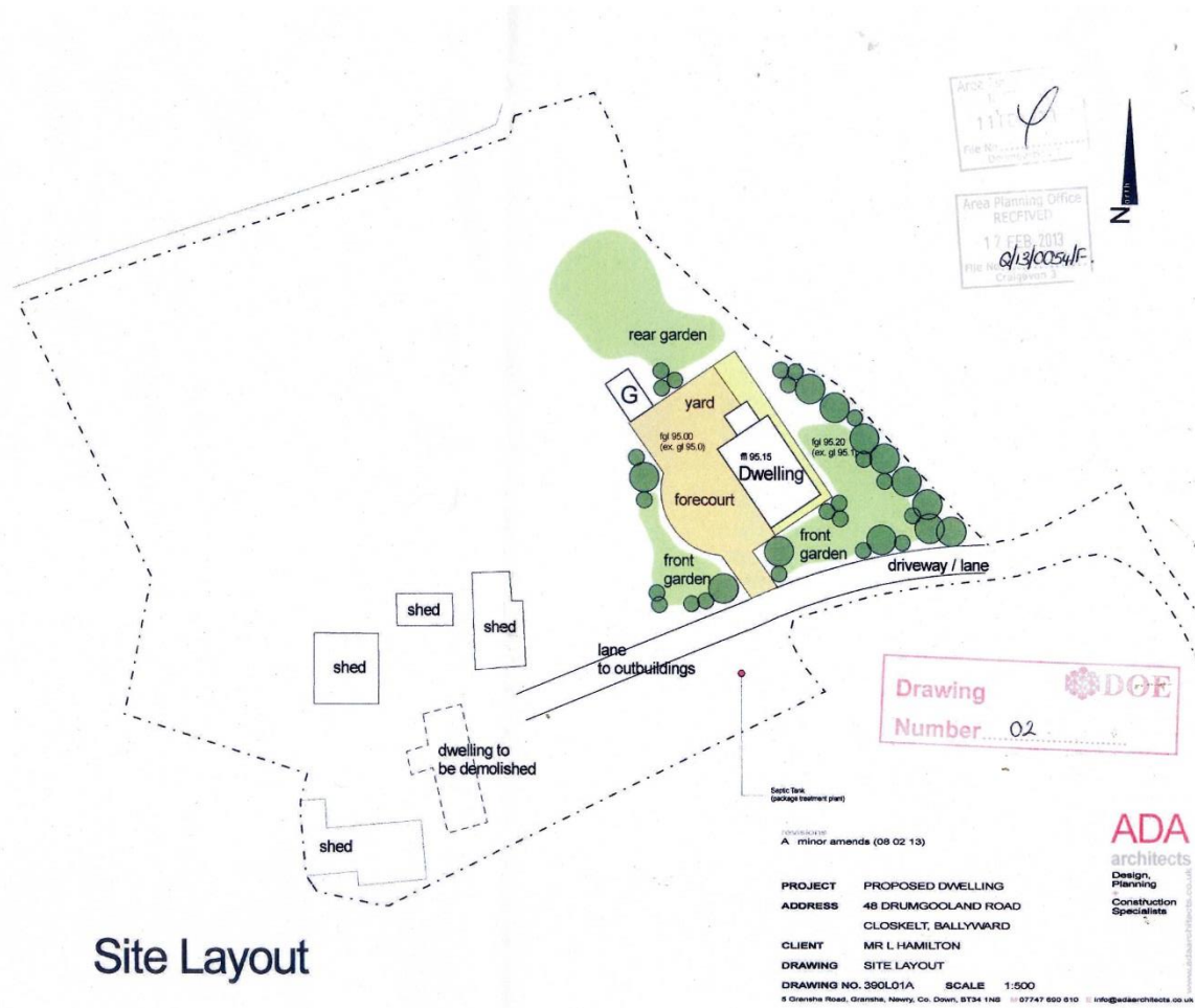
Figure 4: Architect's plan showing proposed site layout