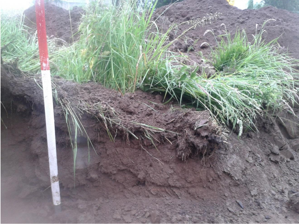
Plate 8: West-facing section in Trench 2 (part of), looking east