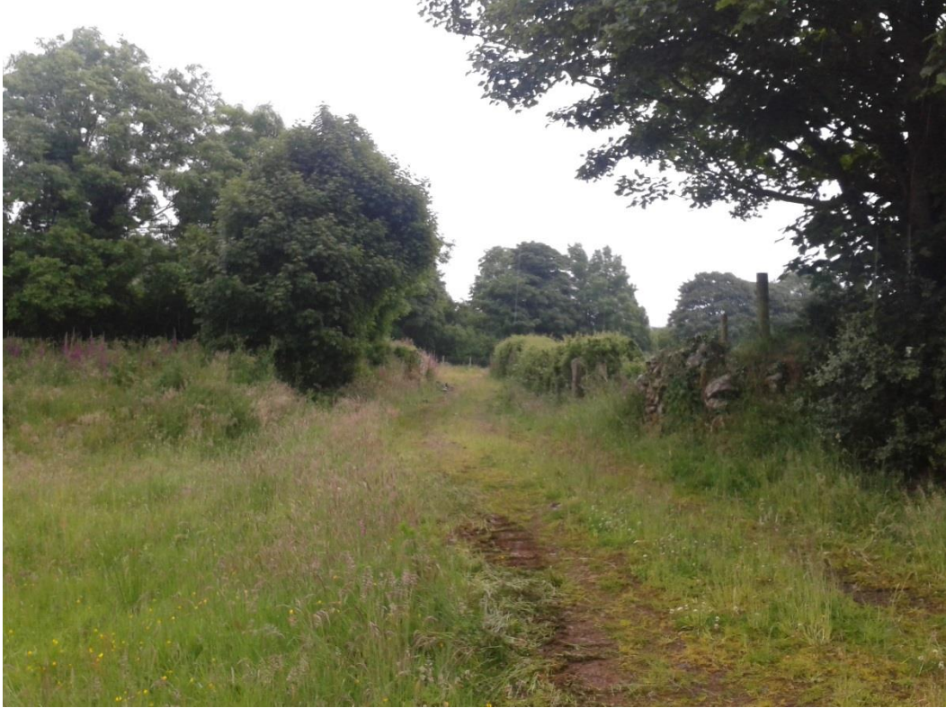
Plate 1: General view of the site prior to evaluation, looking east