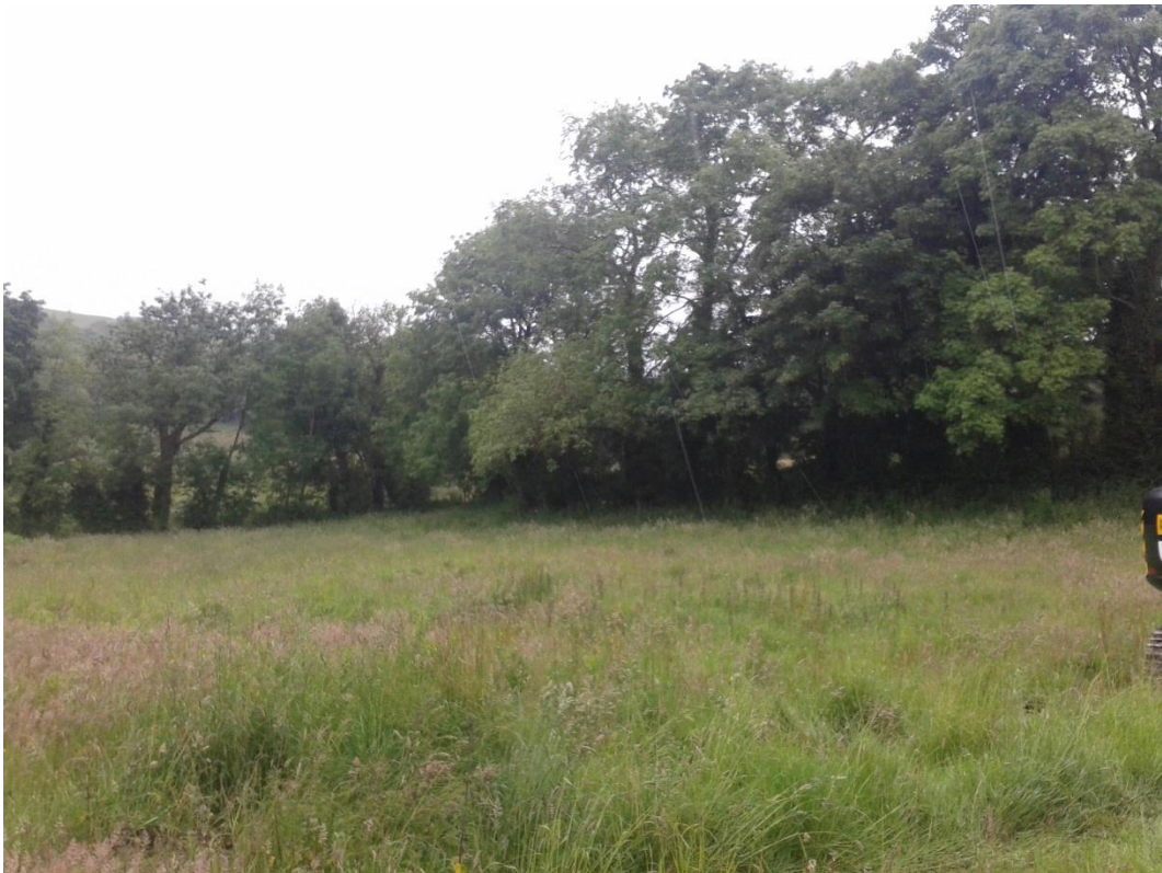
Plate 2: General view of the site prior to evaluation, looking north