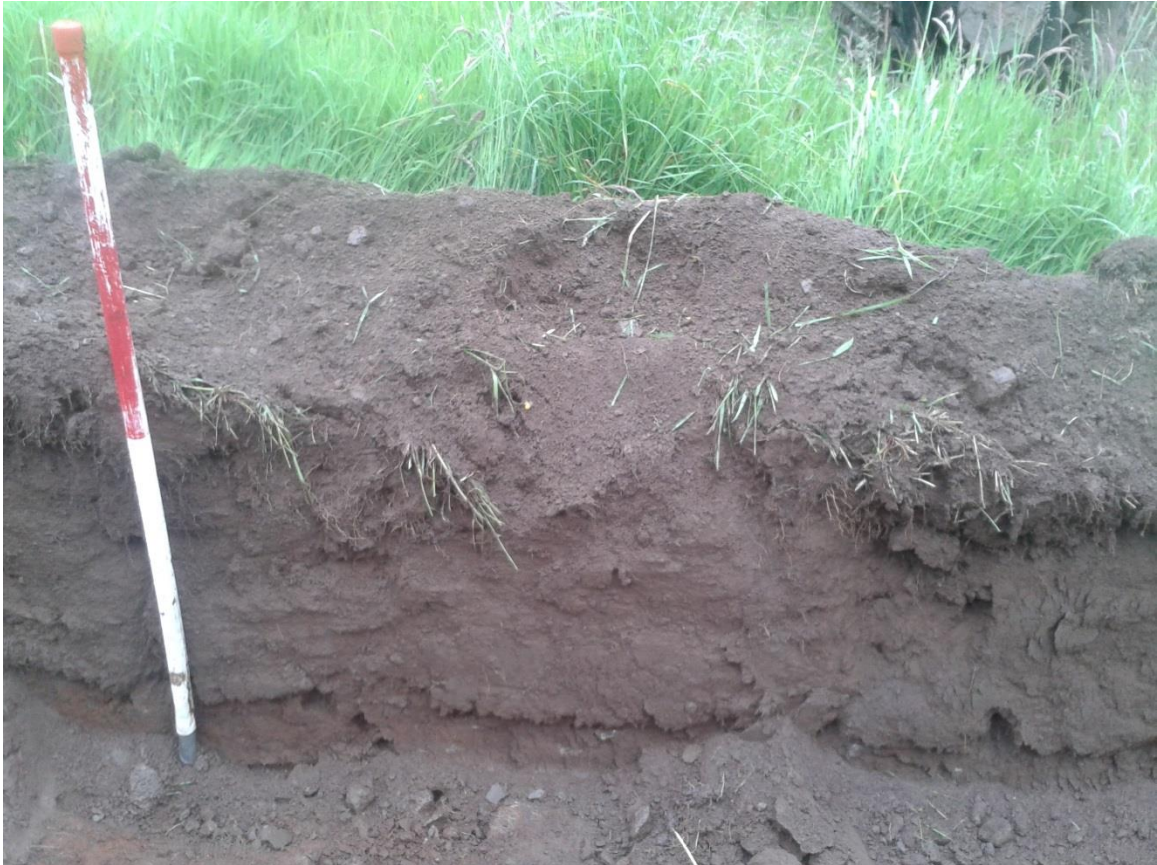
Plate 10: West-facing section in Trench 3 (part of), looking east